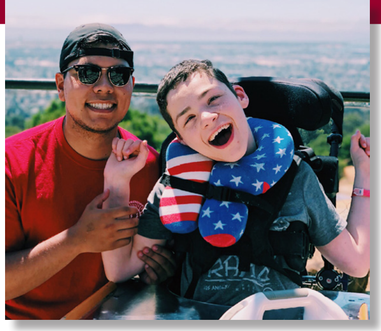
A Via West fieldtrip

To learn more and find out how you can help this nonprofit camp, please visit: https://campingunlimited.org